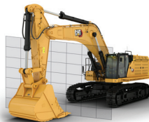
E-WALL CAB PROTECTION